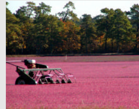
Pinelands farms produce about 40 million pounds of cranberries each year.

The Pinelands offers abundant recreational opportunities,