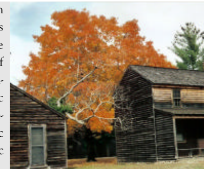
Historic buildings at the Batsto Village in the Pinelands.

Maurice National Scenic and Recreational River. On average, there are approximately one million visits to state forests in the Pinelands each year.