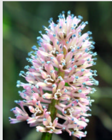
Swamp Pink, a threatened plant species, grows in the Pinelands.

The area is noted by botanists worldwide for its unique native flora. The region boasts 27 species of wild orchids, several insect-eating plant species and some plant species that are currently found nowhere else.