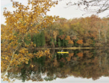
A kayaker paddles on the Batsto Lake in the Pinelands.

Its vast unbroken forests of pine, oak, and cedar make the