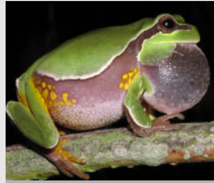
The colorful Pine Barrens tree frog is a threatened animal species that lives in the Pinelands.

Wildlife abounds throughout the Pinelands. Eight-hundred and fifty plant species and nearly 500 animal species can be found in the region, including dozens of rare, threatened or endangered plant and animal species, which are afforded special protection in the Pinelands. The Pine Barrens tree frog, a